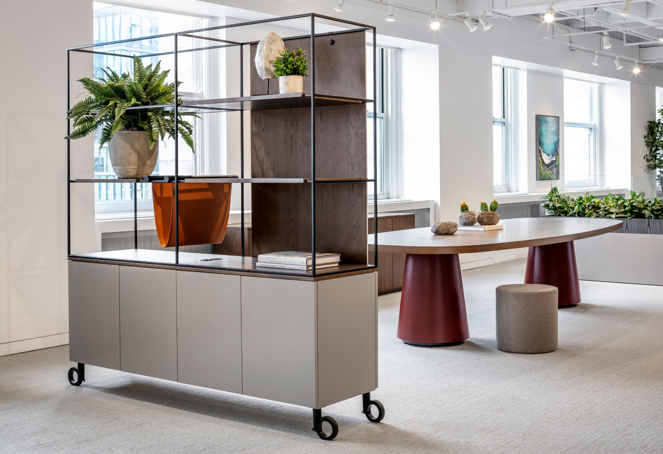
FLOW™ ACTIVITY WALL