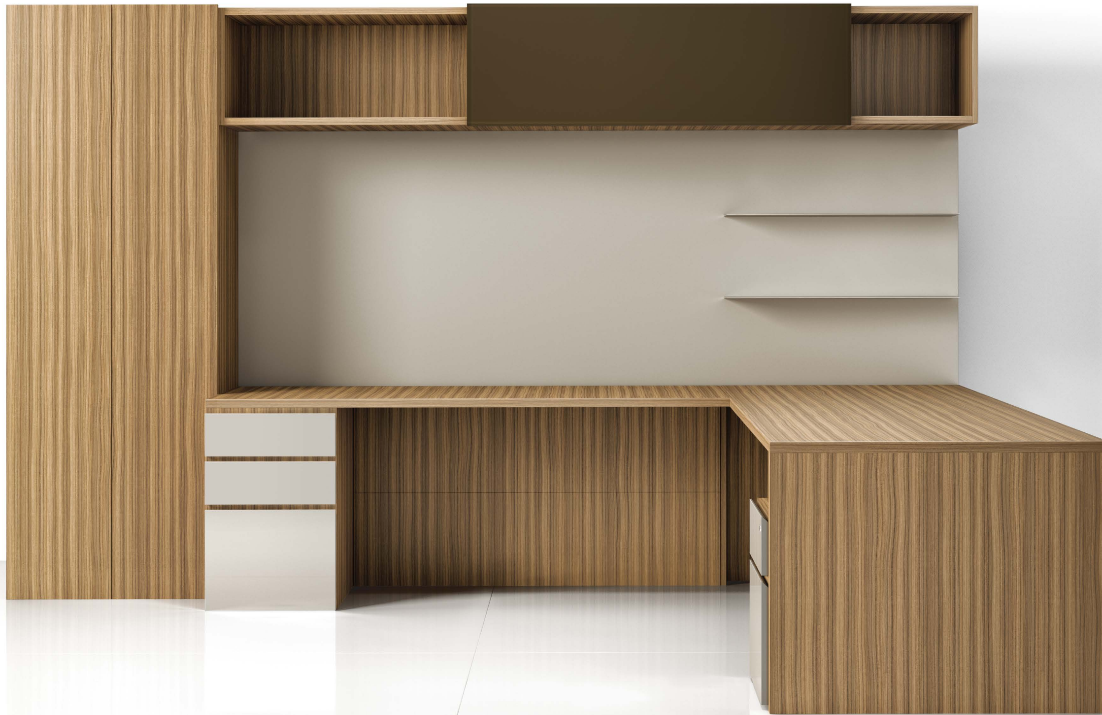
CAMBIUM L-SHAPE Cambium supports both individual focus time and collaboration within the same workspace with an array of tables and workspaces. Above: L-shape casegood configuration shown in Natural Paldao | painted back panel shown in Moonlight paint | display shelves shown in clear anodized metal | overhead shown in Natural Paldao and Clove gloss backpainted glass | pedestal with integrated pull shown in Moonlight paint and Natural Paldao | Meeting table shown in Clove gloss backpainted glass and Aged Bronze powder coat subtop with polished chrome base.