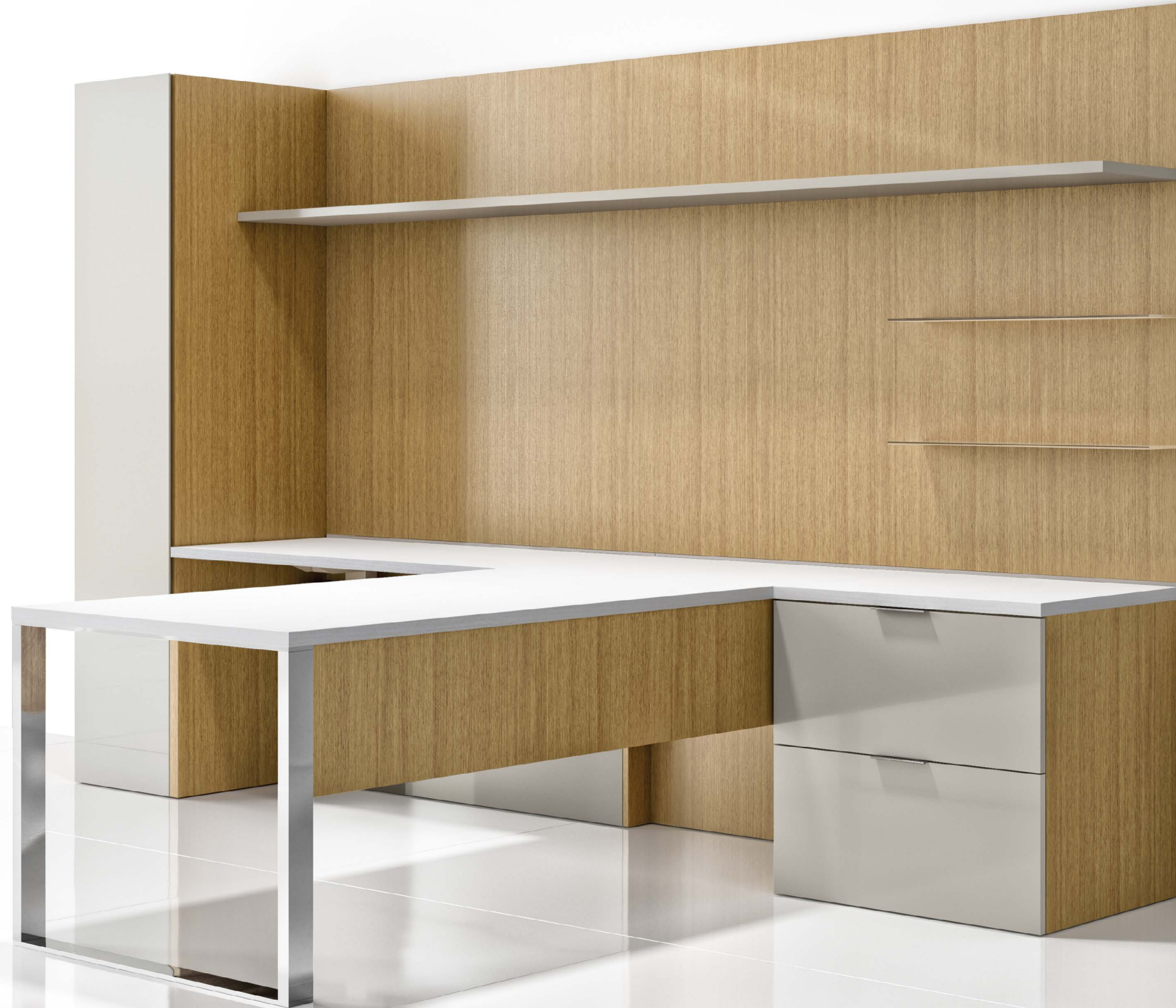
CAMBIUM T-SHAPE Endless material combinations and visually uninterrupted lines create a refined beauty to enhance the office landscape. Above: T-shape casegood configuration shown in Oak Linea and Blanco Ash work surface | tower shown in Oak Linea with Moonlight painted case | overhead shelf shown in Moonlight paint | display shelves shown in Meringue gloss back painted glass | pedestal with metal pulls shown in Moonlight paint and Oak Linea with polished chrome. Cover: Freestanding casegood configuration shown in Marron Walnut | hoop base shown in polished chrome | overhead shelf shown in Marron Walnut with Moonlight paint | tack panel shown in Textus Felt Melange in Griège | pedestals with integrated pulls shown in Moonlight paint.